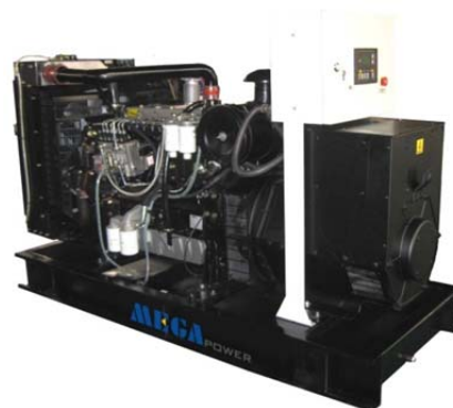
PHOTO FOR REFERENCE ONLY